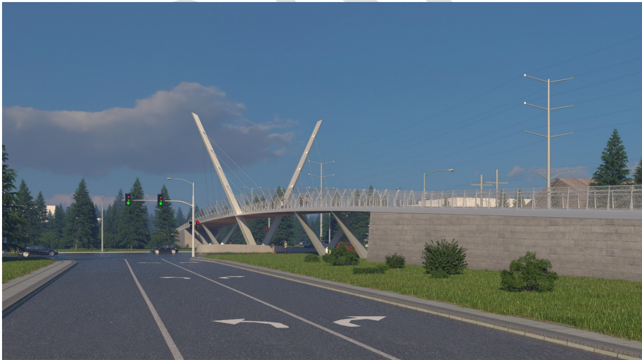
Rendering of Project